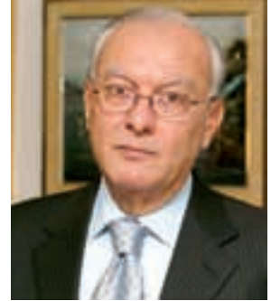
الجهد هو مفتاح النجاح